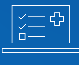
Electronic health records