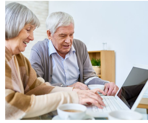
Residents and staff can now confidently and securely access the internet for communication and entertainment.

Keeping their services online became an issue. He only had access to one third-party tech who could troubleshoot some issues and there were two freelance technicians sporadically available to him in the neighboring small town. It was a complicated, time-consuming challenge to keep the network up and running, and cut into time allotted for his administrative duties. There was the operational side of it, but there were also complaints from the