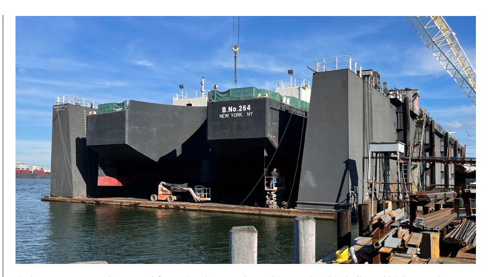
To better manage a large workforce simultaneously working under ship hulls and high over them, Caddell Dry Dock and Repair Co. Inc. counts on total WiFi coverage. This is made possible using Managed Network Edge augmented by dozens of strategically placed access points.