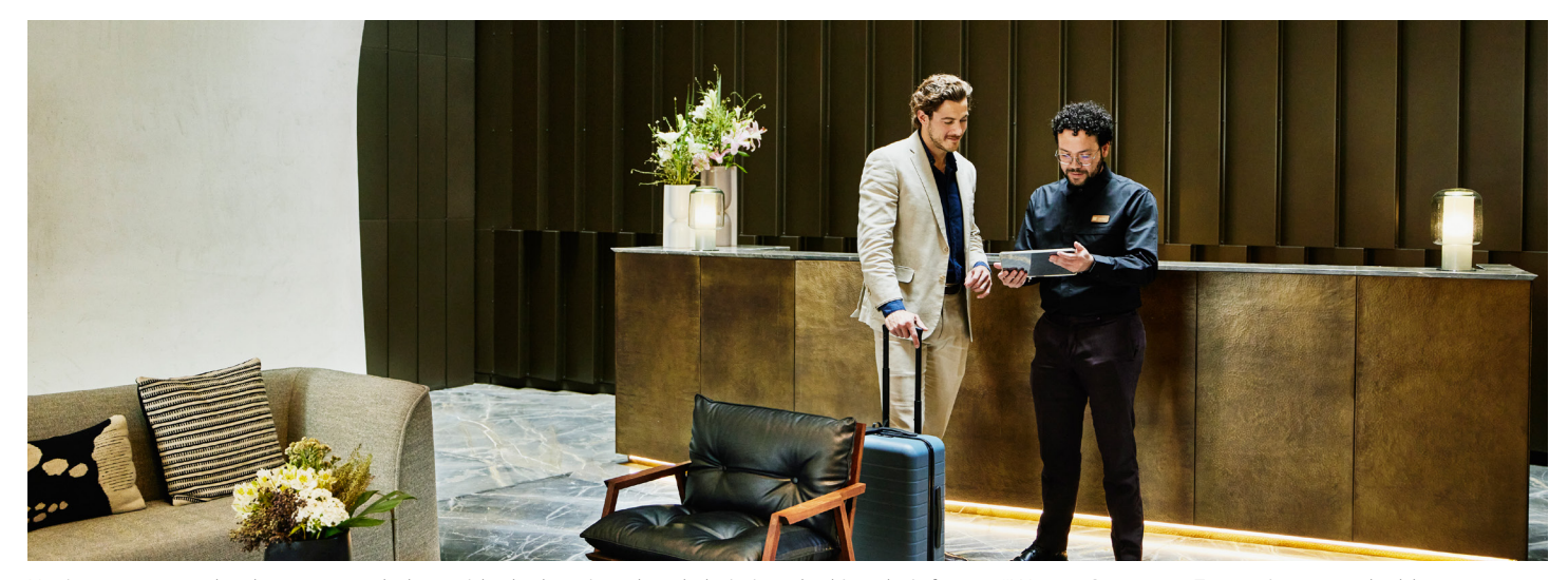
Having a smart technology partner helps guide the boutique hotel chain in unlocking their future. "We see Spectrum Enterprise as a valuable resource not just in terms of designing solutions, but informing our strategy," the IT director says.

be working and it's got to be 100%. Spectrum Enterprise enables us to deliver those capabilities."